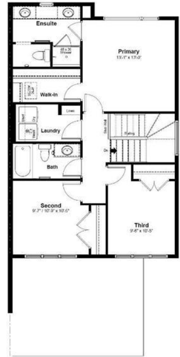
UPPER FLOOR PLAN 852 SQ.FT.

Data is supplied by Pillar 9â,,ç MLSÂ® System. Pillar 9â,,ç is the owner of the copyright in its MLSÂ® System. Data is deemed reliable but is not guaranteed accurate by Pillar 9â,,ç. The trademarks MLSÂ®, Multiple Listing ServiceÂ® and the associated logos are owned by The Canadian Real Estate Association (CREA) and identify the quality of services provided by real estate professionals who are members of CREA. Used under license.