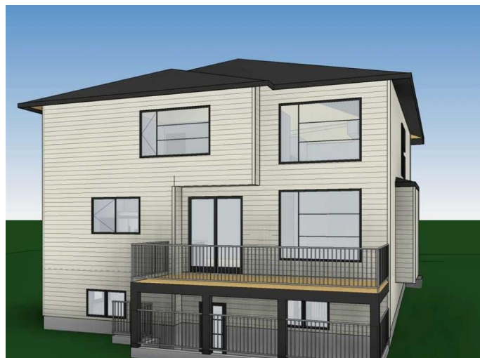
24 N Bridges Glen, Langdon, AB